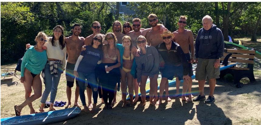
Last year's Paddle Out at Long Pond in Wellfleet, MA

*Can't come to event and/ or want to donate using a no-touch app? We have a BRAND NEW QR Code that brings you straight to our donor page for Tax Deductible Donations.